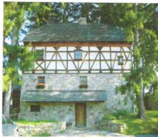
The House of Yoder and the south entrance