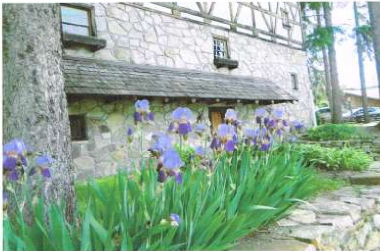
Some of the pretty flowers in front of The House.