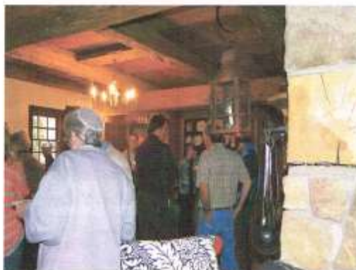
Members enjoying refreshments before the meeting.