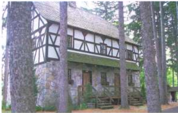
The House of Yoder, all cleaned up, ready for another year!

The House of Yoder officially opened on Memorial Day weekend. But before that day, the house had to be cleaned and prepared for the summer. The House of Yoder Board of Directors met on Saturday, May 18. Furniture was dusted, walls were washed, floors scrubbed or vacuumed. The storm windows were taken down and the windows were washed,