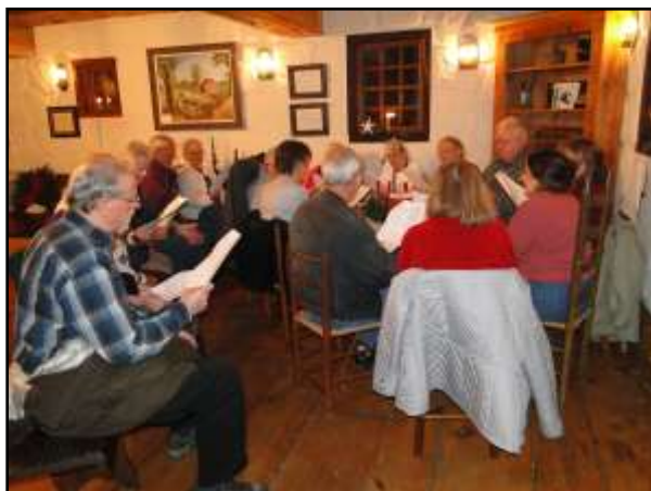
Friday evening, a singing group sang Christmas Carols in the German language.