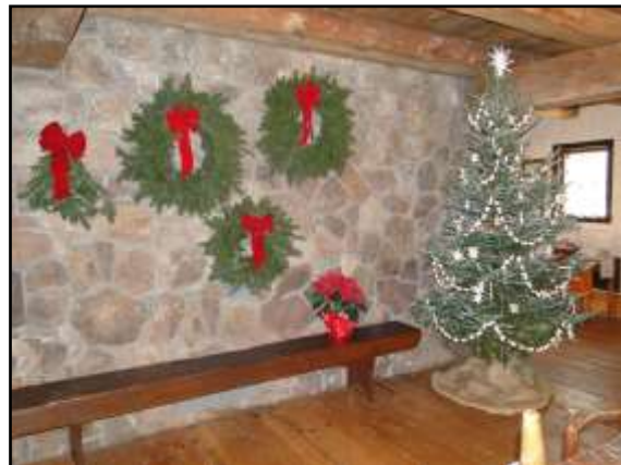
The back of the main floor fire place, decorated with wreaths, poinsettia and the tree.

House of Yoder was festively decorated with live pine wreaths, beautiful poinsettias, a Christmas tree strung with popcorn and cranberries, paper stars and a warm fire in the fireplace. The mouth-watering aroma of freshly popped popcorn drifted in the air, creating a welcoming atmosphere.