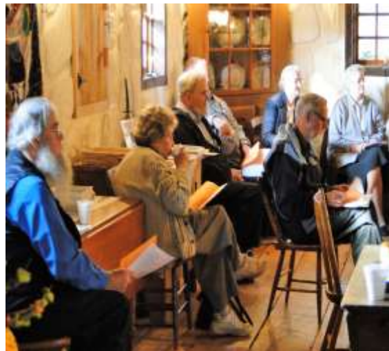
Some of the members of The House of Yoder during the meeting.