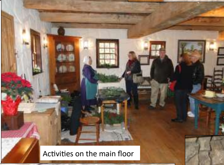
Activities on the main floor