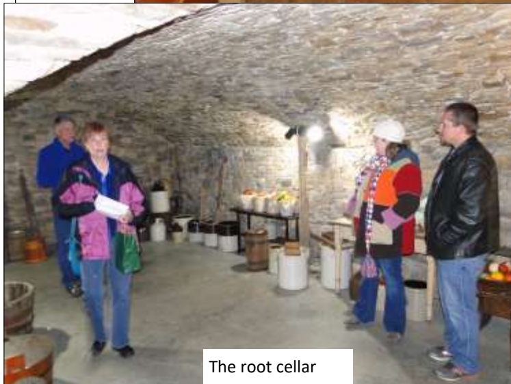
The root cellar