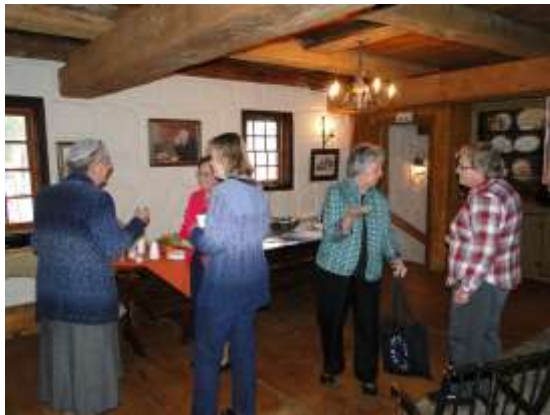
Some of the ladies enjoying the refreshments.