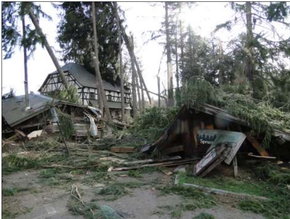
From the Penn Alps Restaurant parking lot, looking south west towards The House