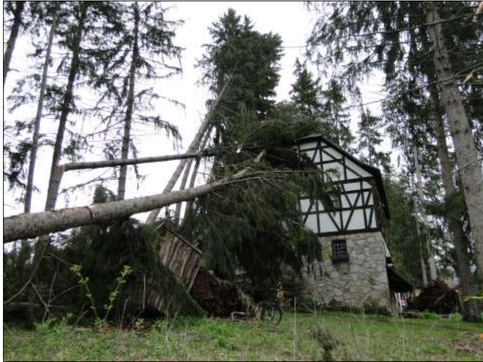
Trees blown on to the west side of The House.