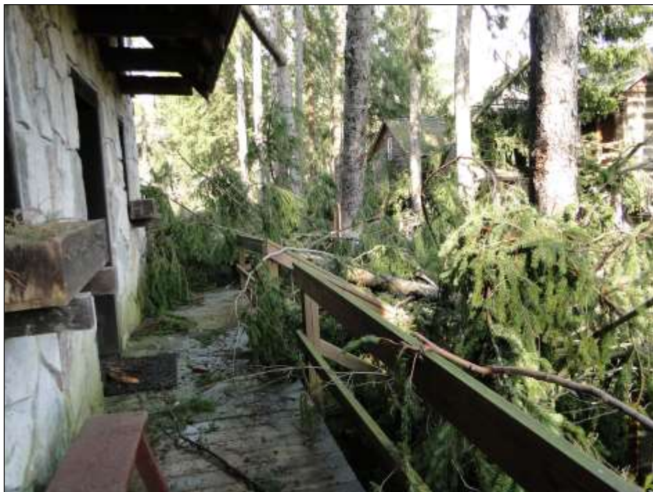
The front porch of The House of Yoder.