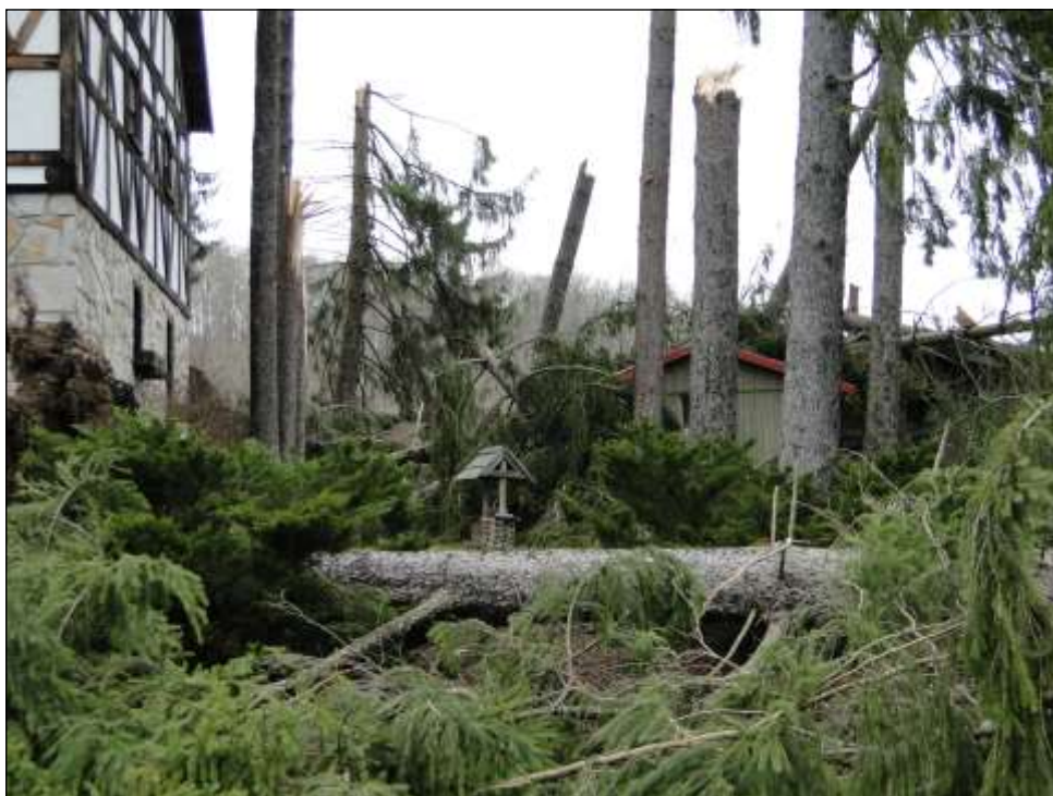
From the Route 40 parking lot, looking towards the village.