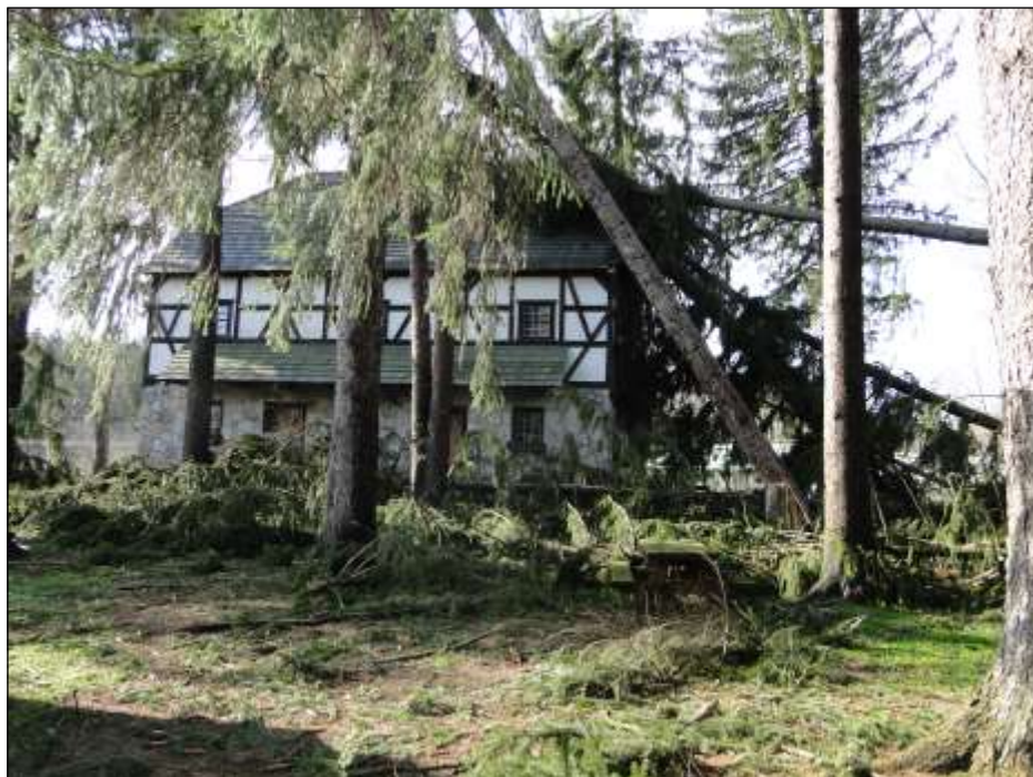
The House of Yoder with trees blown onto the roof.

In the early hours of Wednesday April 8, 2020 a possible tornado touched down in the Spruce Forest Artisan Village. Many of the old tall Norway Spruce trees, estimated to be over 100 feet tall were destroyed. Tops of the trees were torn off and blown many feet away. Several trees were uprooted. Several of the cabins in the village were also damaged, some being destroyed. The House of Yoder received damage to the roof, front entrance and chimney. Broadwater Trees Service, of Grantsville, MD began cutting up and hauling out the downed trees and branches later that same day. A total of 46 trees were removed from the Spruce Forest Artisan Village.