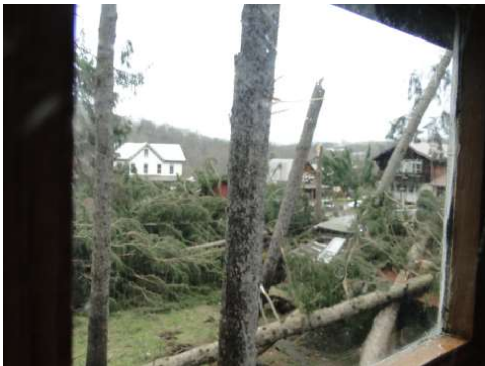
Looking toward Penn Alps Restaurant from the second floor of The House