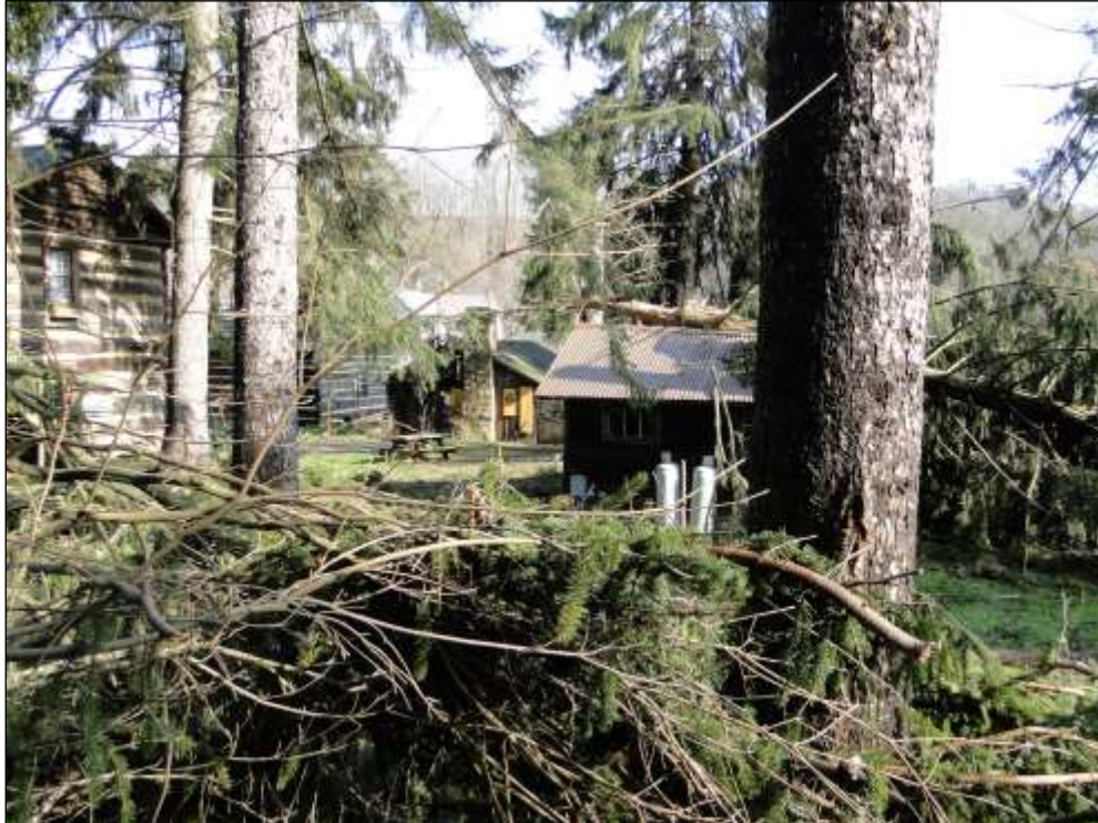
The view from the front door of The House of Yoder.