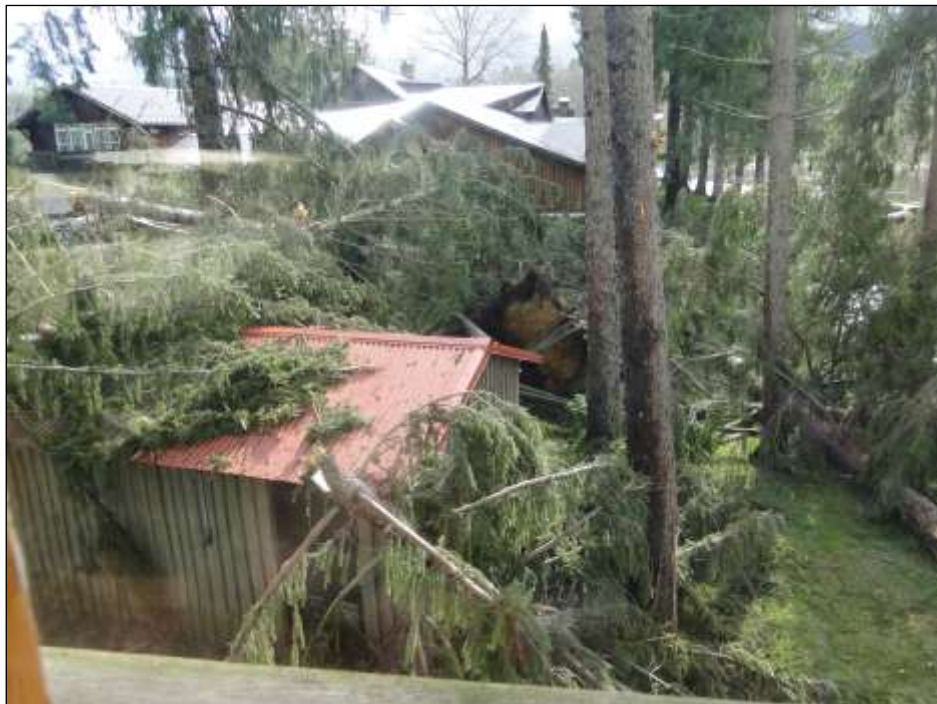
From the second floor window, looking east, towards Penn Alps Restaurant.