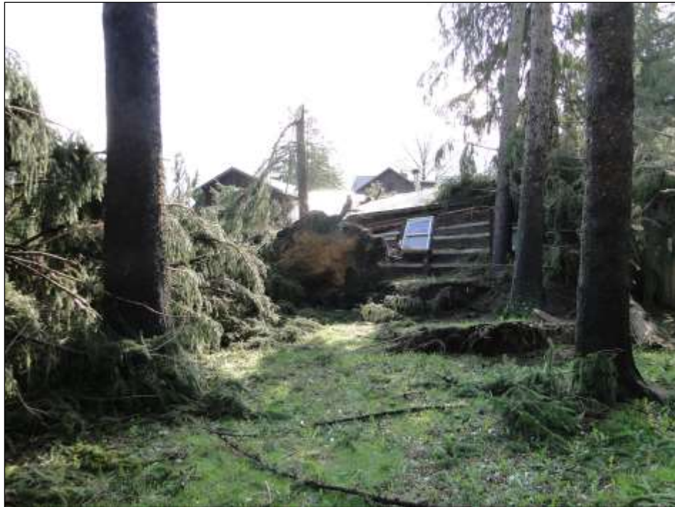
Looking towards Penn Alps Restaurant. Notice the uprooted trees and destroyed cabin.