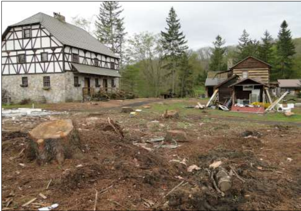
From Penn Alps Restaurant, looking towards The House of Yoder

Photograph taken Wednesday, May 20, 2020