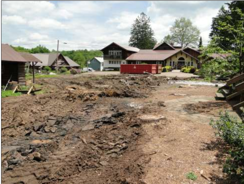
From the north west corner of The House of Yoder, looking toward the Spruce forest Village and Penn Alps Restaurant

Photograph taken Wednesday, May 20, 2020