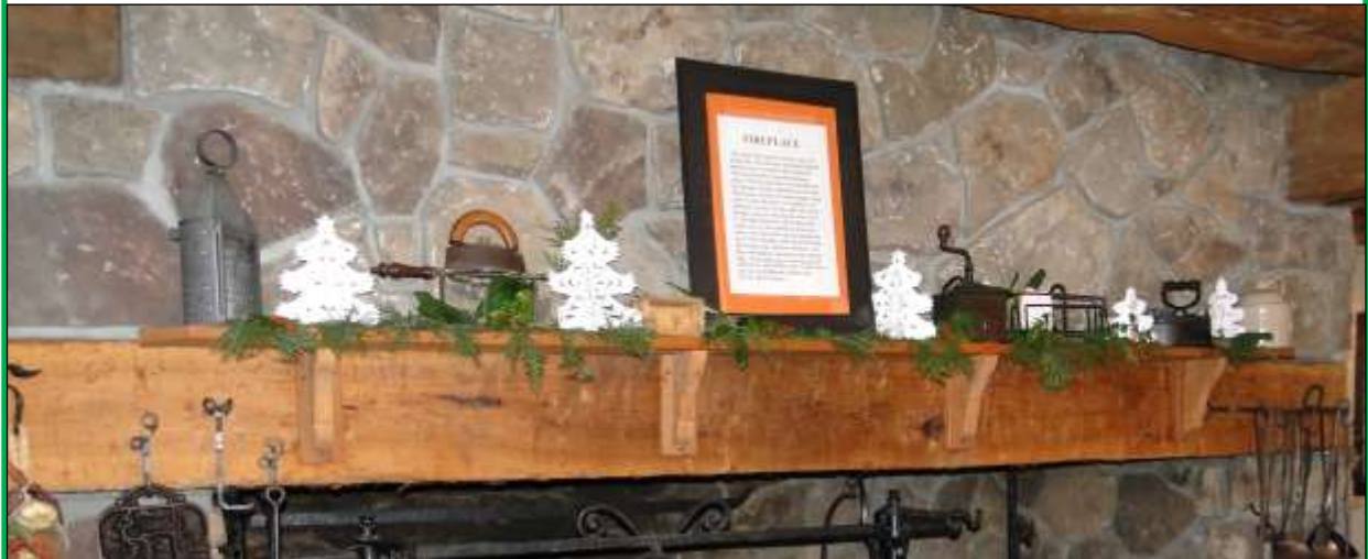
The massive fireplace mantle beautifully decorated for Christmas in The Village

Christmas In The Village was once more held Friday, December 3 and Saturday, December 4, 2021 at the Spruce Forest Artisan Village. The House of Yoder was dressed in beautiful greens, with white paper angels, snowflakes and trees placed throughout the house.