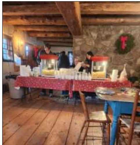
Pictured above: The popcorn table, with bags of popcorn, ready to be handed out.